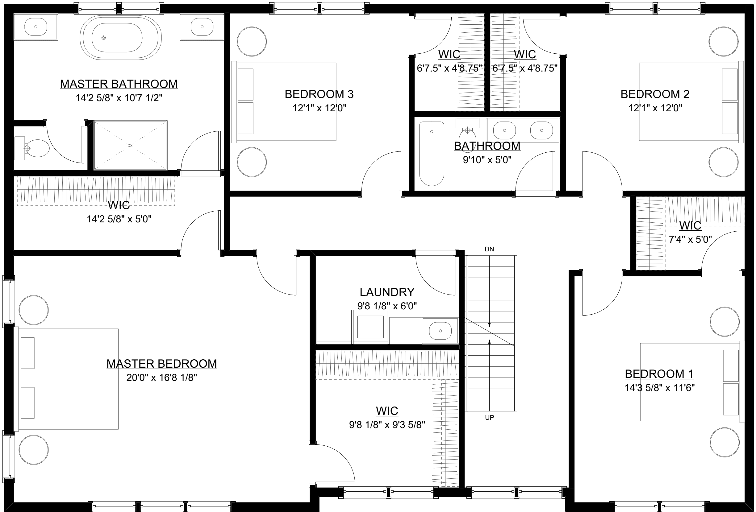
3 SECOND FLOOR PLAN Scale: 1/4" = 1'-0" PROPOSED SECOND FLOOR AREA: 1719 SF